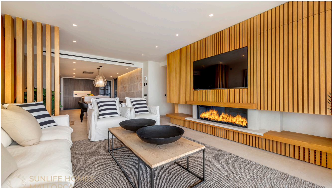
Modern Flat with Premium Features