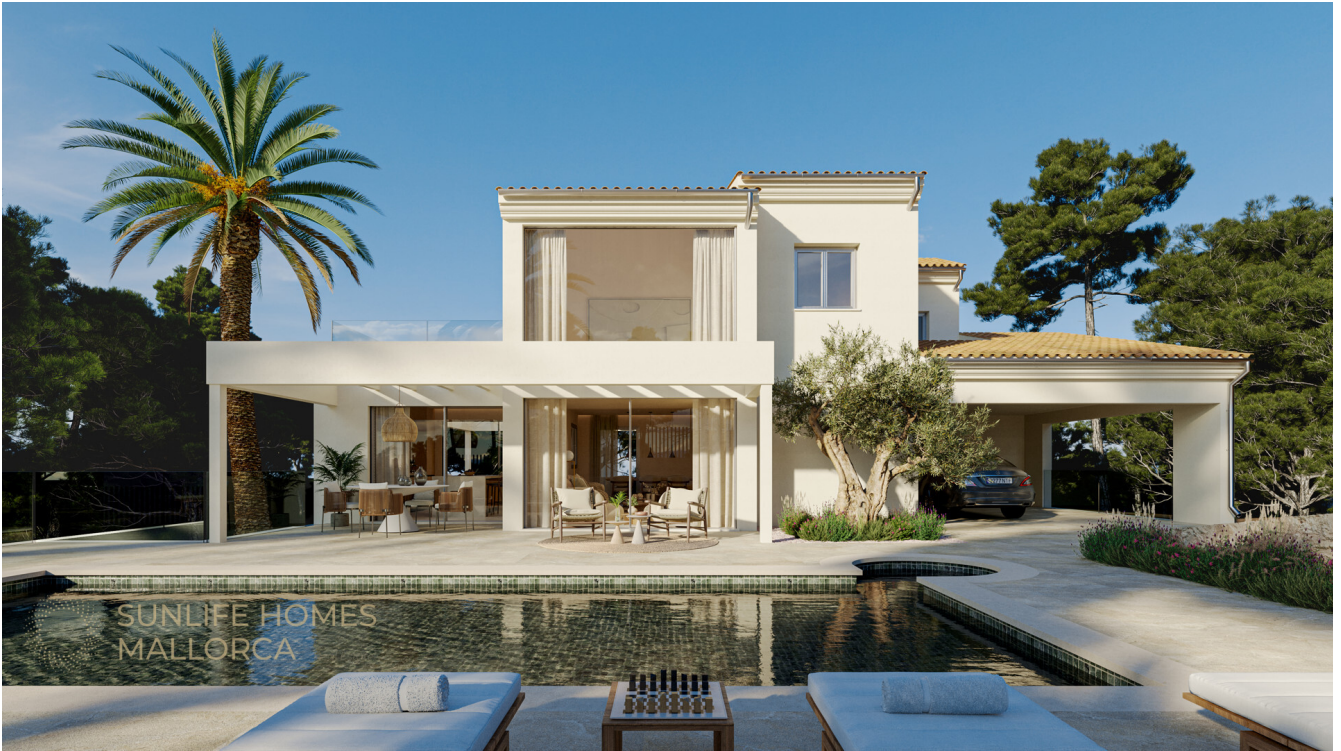
Villa Santa Ponsa