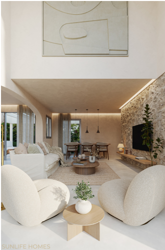
Villa Santa Ponsa