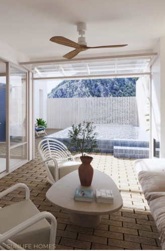
Townhouse Pollensa Mallorca