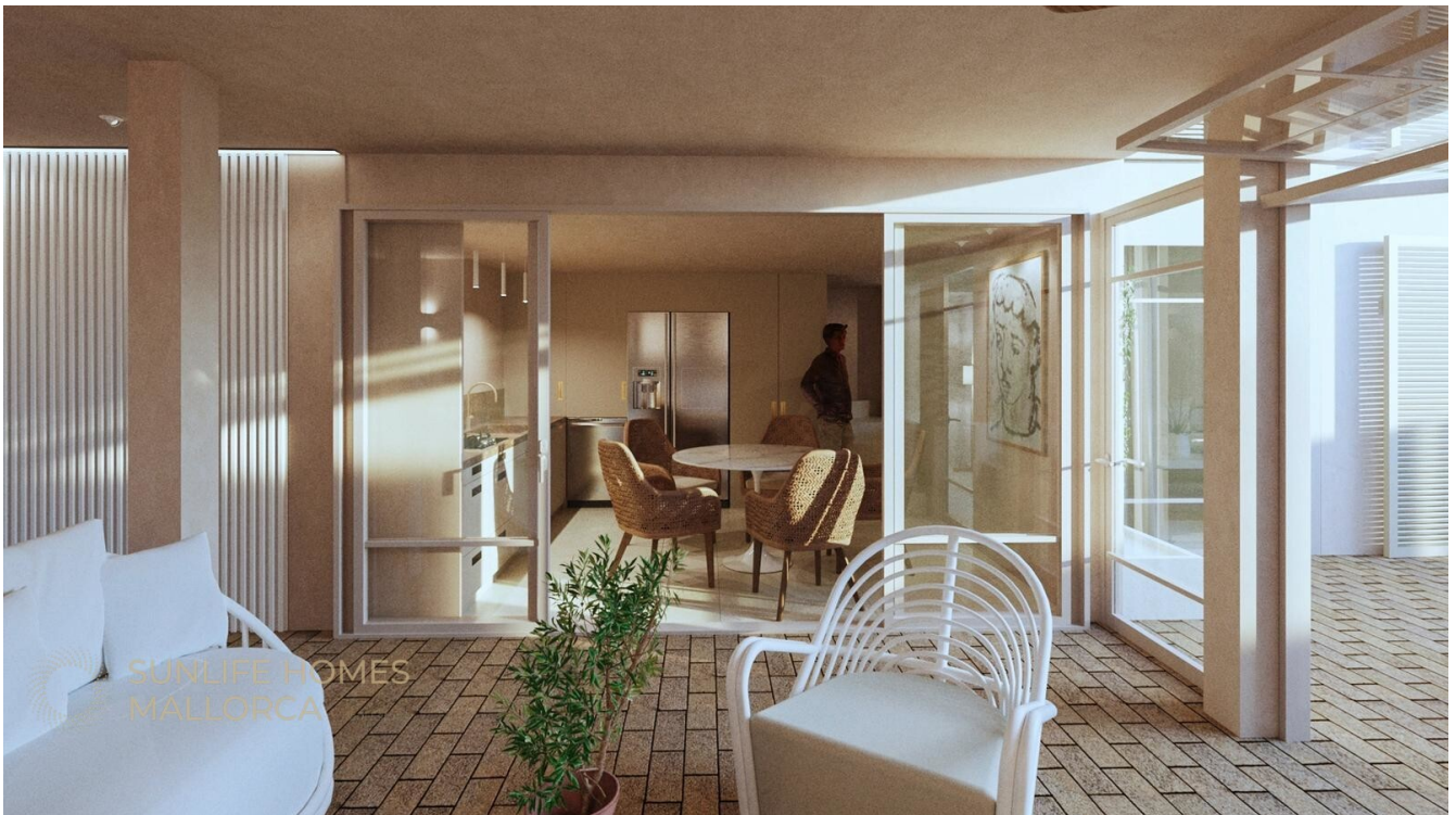
Townhouse Pollensa Mallorca