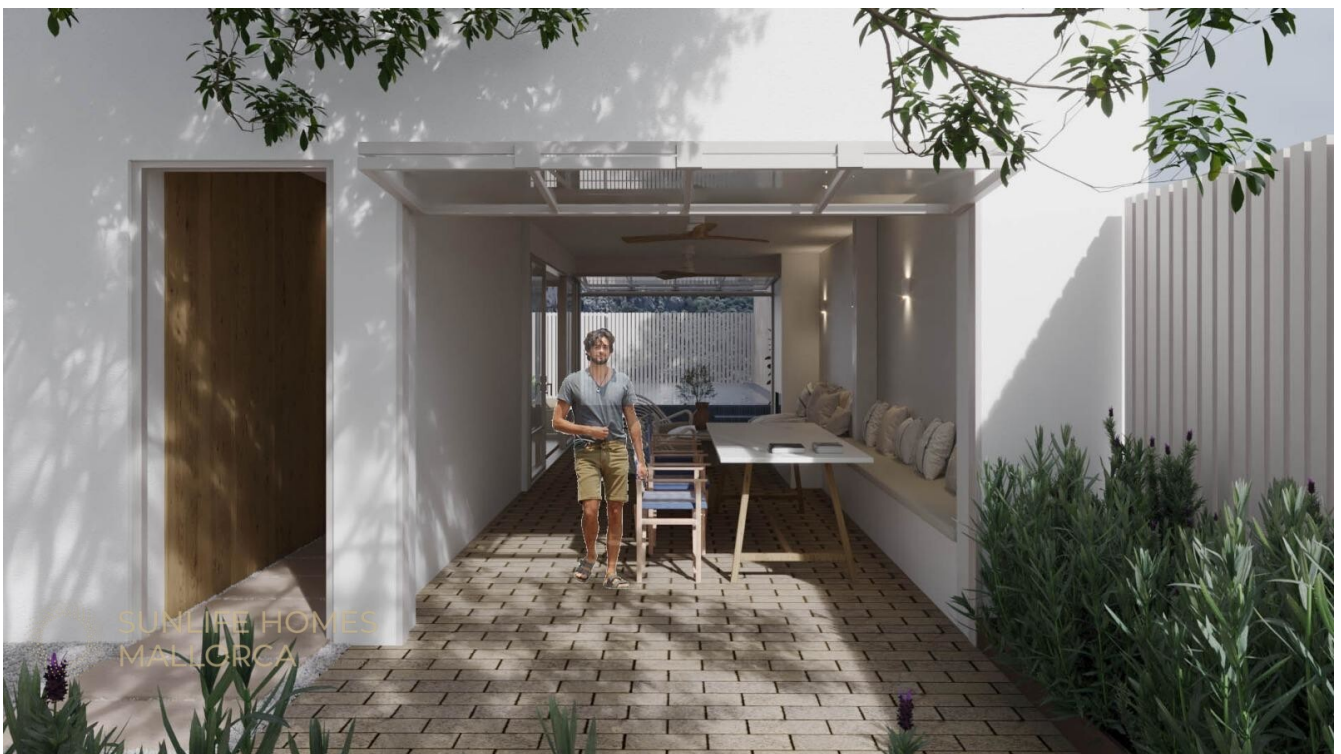
Townhouse Pollensa Mallorca