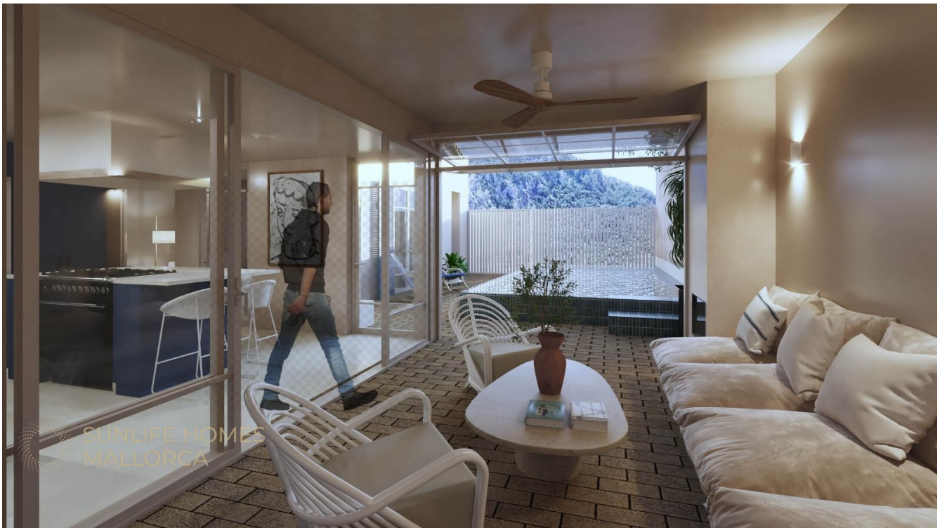
Townhouse Pollensa Mallorca