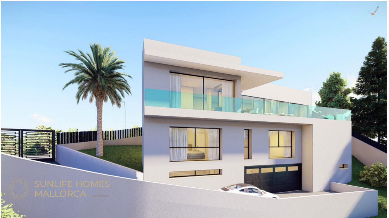
Contemporary architecture with impressive design lines