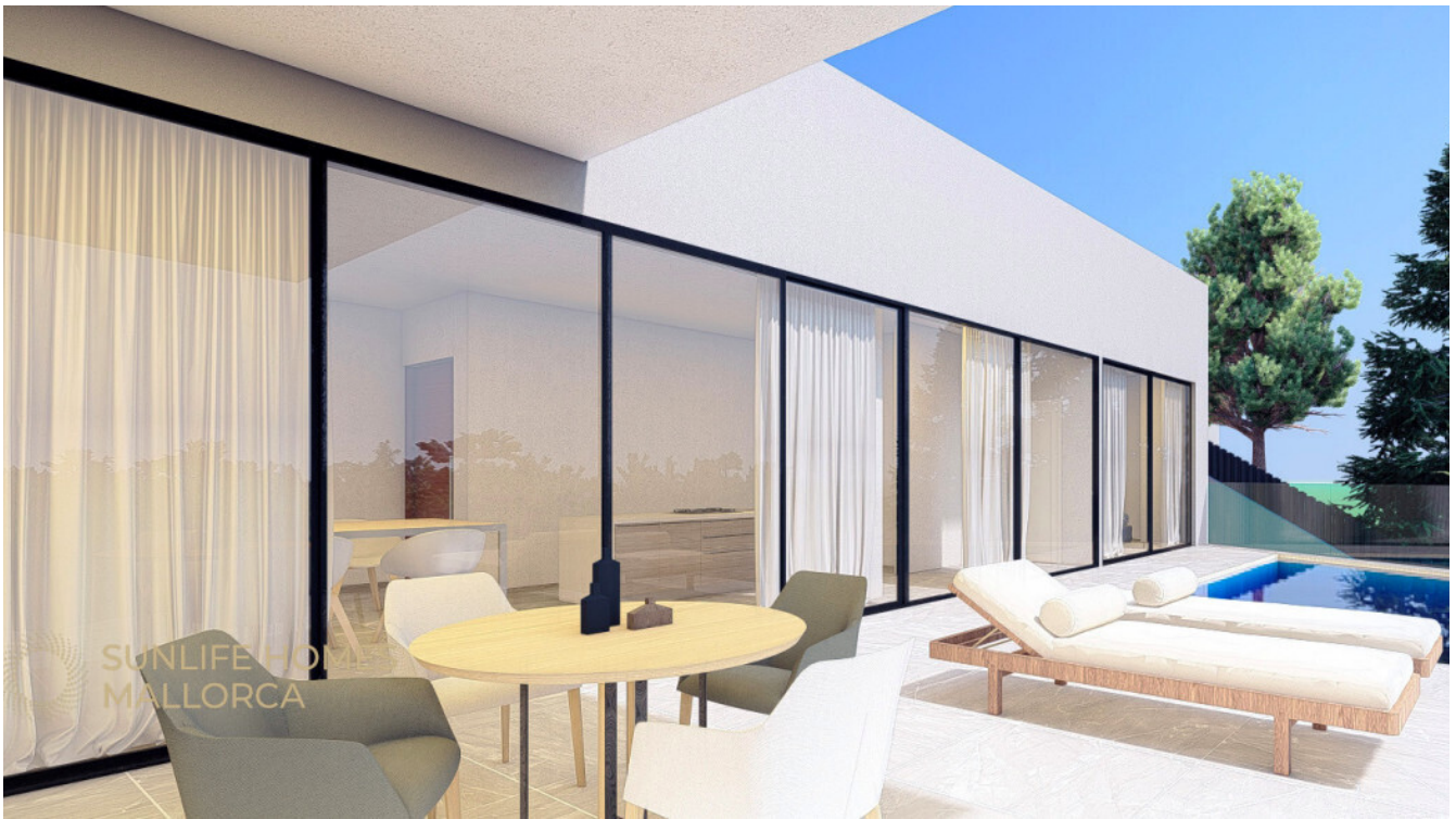
Sunny terrace with generous space for outdoor living