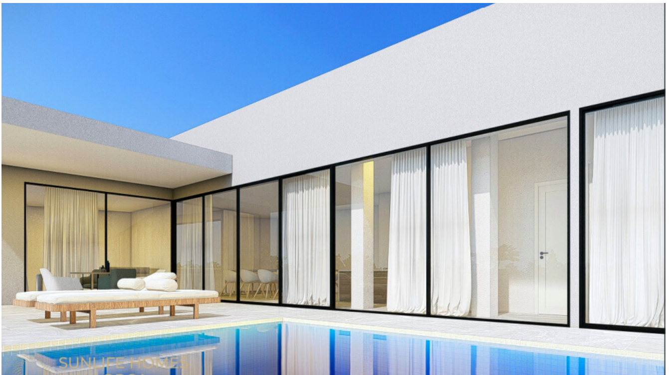
Spacious pool area for relaxed Mediterranean living