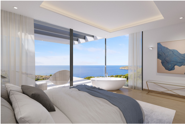
Villa Santa Ponsa